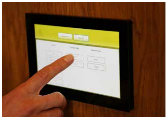
7" Modero X Series panels afford fingertip control of in-room settings