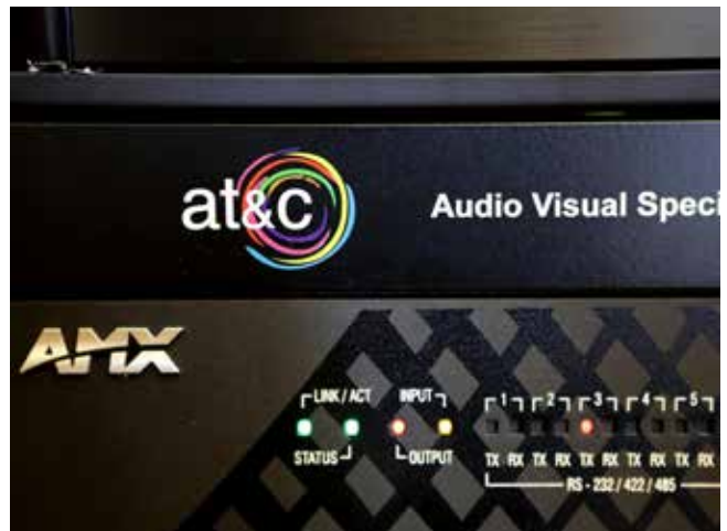
The Enova DVX is the centrepiece of this innovative solution