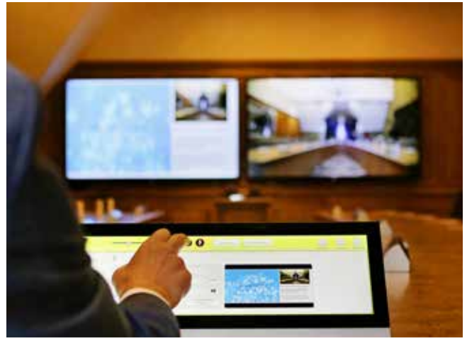
The panels' panoramic proportions allow guests to perform multiple tasks, simultaneously